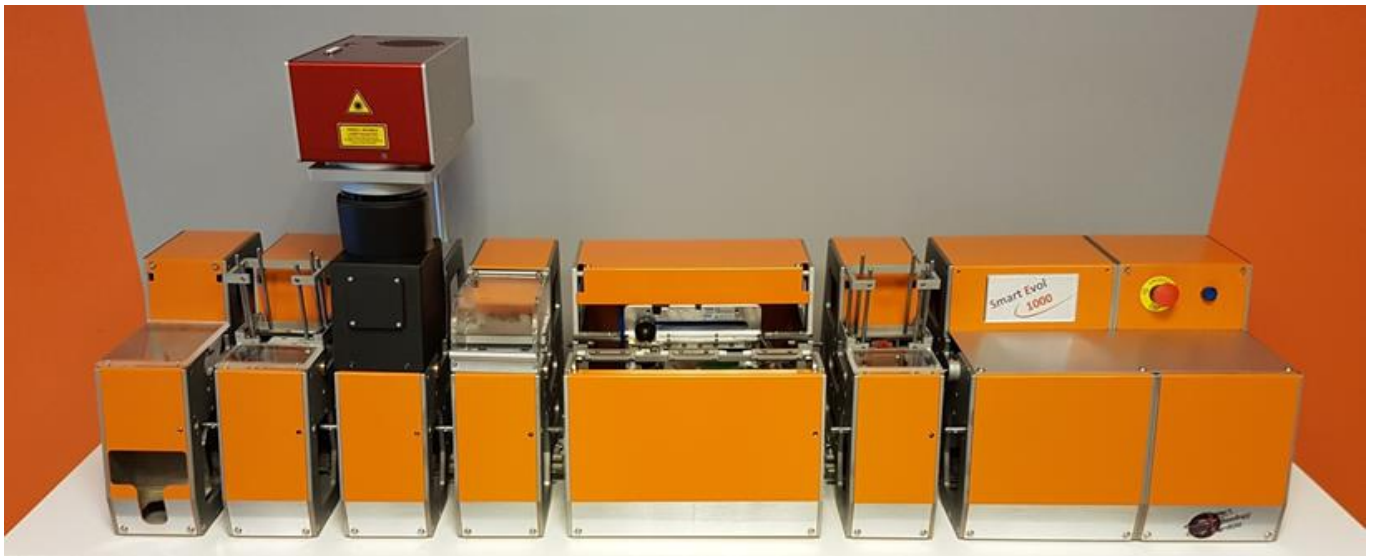
The full modularity of the Smart Evol 1000 facilitates on site upgrades to support new requirements. It also facilitates the maintenance.