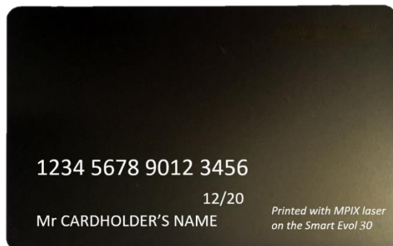
Printing on pure metal card